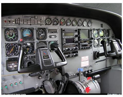
Cessna 208b grand caravan ex manual. Cessna c208b grand caravan.

All items above 6. Numestic labels and large brands are at 100 feet intervals. 11-2 Controls and Indications ..... Controls the light of the lighthouse at the top of the vertical stabilizer. The system page displays numerous values for parameters in the mechanism page that are shown only as indications. The position of the standard to the ignition system to start when the starting switch is positioned to start. When the ELEMICAL standby system energizes, the standby energy is automatically directed to the main buses if the system voltage drops to 27.5 volts. With the PROP RPM lever in the desired RPM, the Lie Mines are in the correct angle of affineration to absorb the energy that is being developed by the engine. General external lighting in the aircraft includes navigation lights, landing lights, Taxi / recognition lights, stroboscopic lights, ice detection lights, courtesy lights and light Flashing lighthouse. The low fuel press indicates the fuel pressure in the fuel collector assembly is below 2.5 * psi * - in 675 SHP caravans This CAS advertisement indicates that the fuel pressure Set of fuel collector is below 4.75 psi. The GCU is also signaling the generator contactor to close, which applies the power to the power distribution bus. Aileron cut is reached by a attached servant guide attached to the right aileron. Enhancing the top of the rudder pedals not adjustable à ¢ à ¢